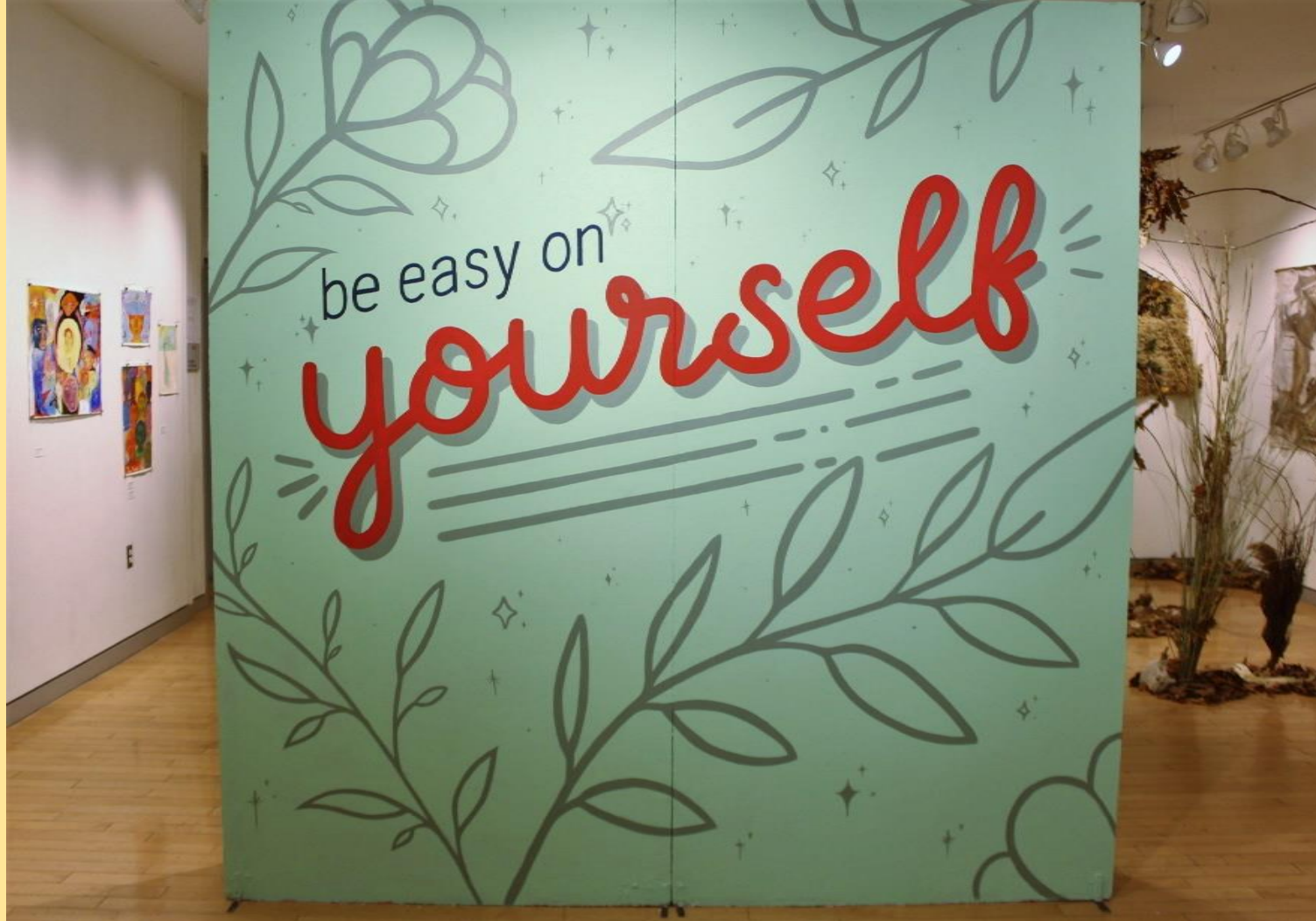
Be Easy on Yourself Acrylic paint on dry wall 97.5 x 97.5"