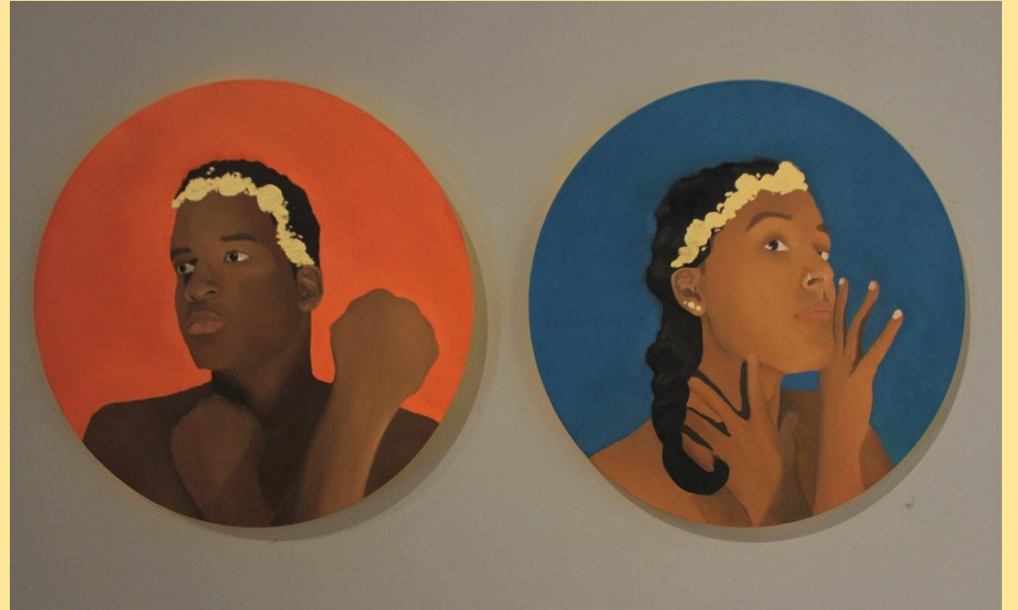
The Gods I Call Friends 2021-22 Oil on wood panel 24" diameter