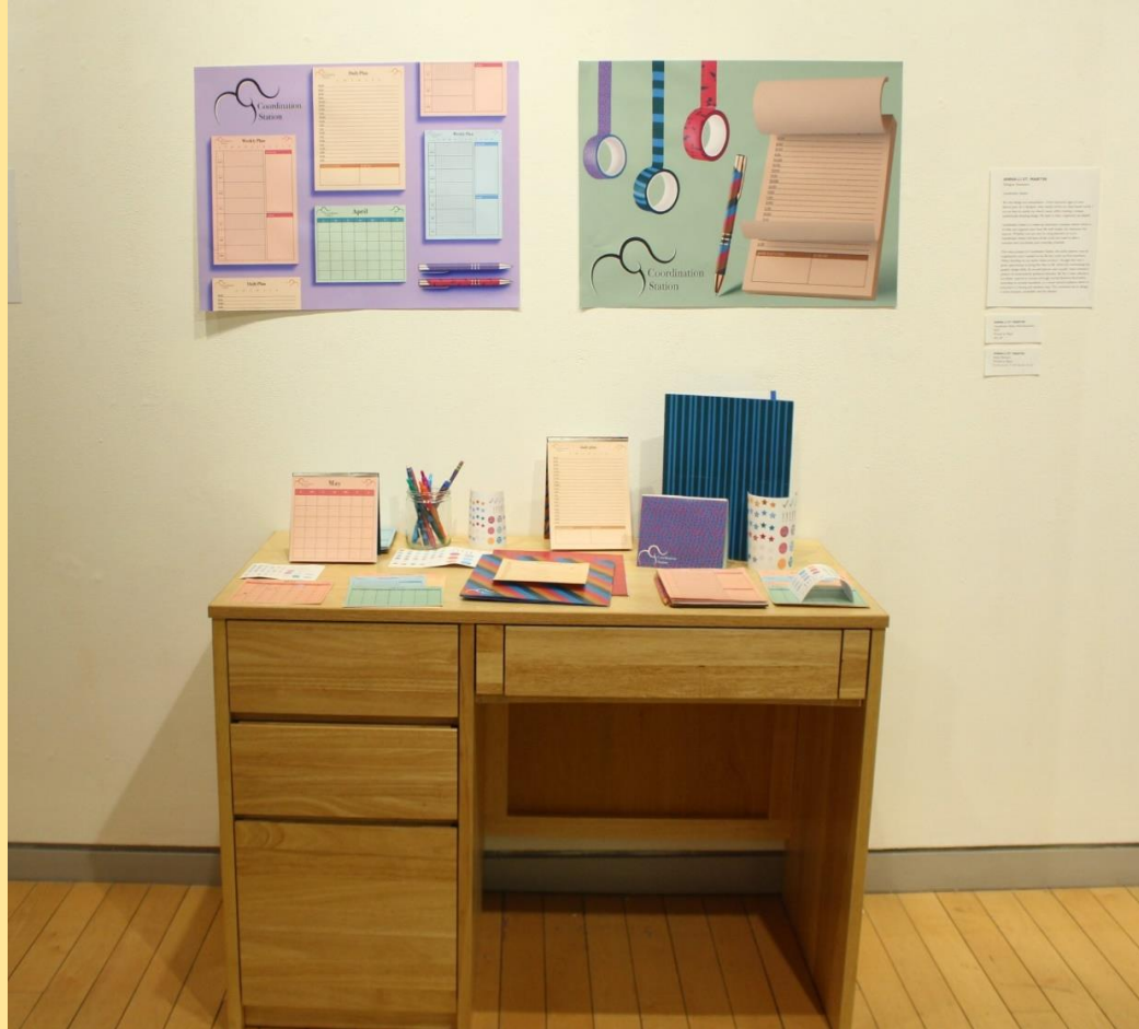
Coordination Station Advertisements 2022 Printed on Paper 18 x 24"