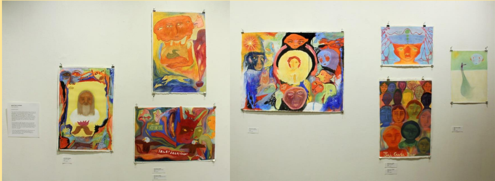
The Nature of Bliss 2022 Oil on paper