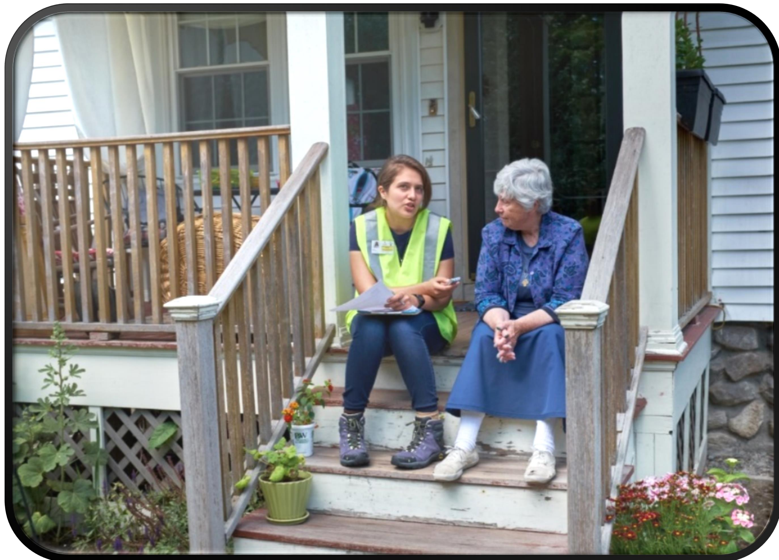
Figure 2: Photograph of interview in progress with local resident

Over the course of our study, we conducted 67 short interviews and 12 long interviews. After recording and transcribing the 79 interviews we coded them based on the following themes: general tree care, environmental awareness, relationship with stakeholders, change in neighborhood and community, the process of getting tree(s), and general feelings.