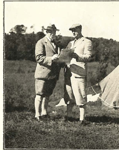
PLANNING THE DAY'S WORK

FOR the first time since the inception of the new science of geography, an entire school has been moved into the field, there to undertake actual surveying and other practical study as a part of its required work. Immediately on the opening of Clark in September, the Graduate School of Geography moved into camp at the Taylor farm, west of Greenfield, Massachusetts, amid the Berkshire Hills.