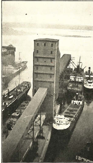
A MONTREAL GRAIN ELEVATOR