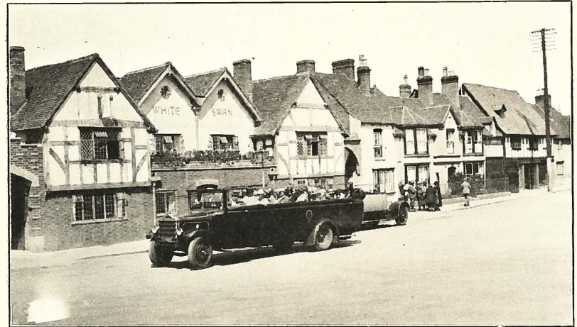
THE PARTY AT STRATFORD-ON-AVON